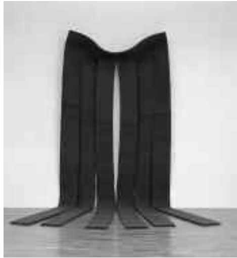
IMAGE ELEVEN: Robert Morris. American, born 1931. Untitled . 1969. Felt, 15' 3/4" x 6' 1/2" x 1" (459.2 x 184.1 x 2.5 cm). The Gilman Foundation Fund. © 2007 Robert Morris / Artists Rights Society (ARS), New York