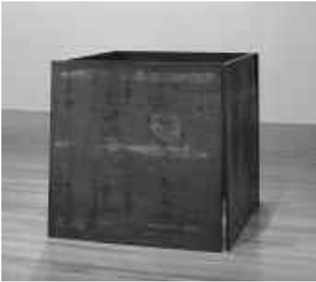
IMAGE TEN: Richard Serra. American, born 1939. One Ton Prop (House of Cards) . 1969 (refabricated 1986). Lead, four plates, each 48 x 48 x 1" (122 x 122 x 2.5 cm). Gift of the Grinstein Family. © 2007 Richard Serra / Artists Rights Society (ARS), New York