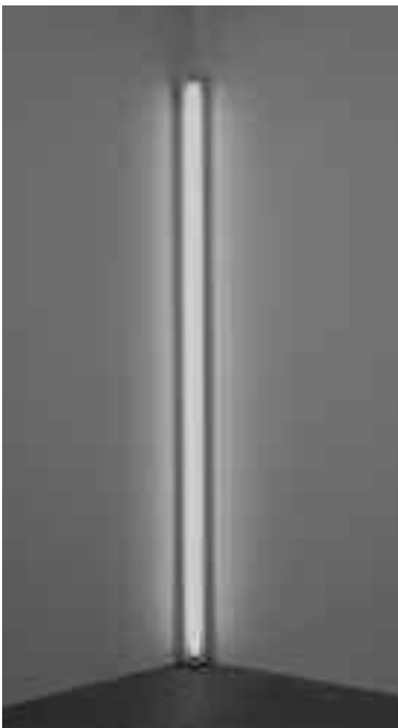
IMAGE TWELVE: Dan Flavin. American, 1933–1996. Pink out of a Corner—To Jasper Johns . 1963. Fluorescent light and metal fixture, 8' x 6" x 5 3/8" (243.8 x 15.2 x 13.6 cm). Gift of Philip Johnson. © 2007 Estate of Dan Flavin / Artists Rights Society (ARS), New York