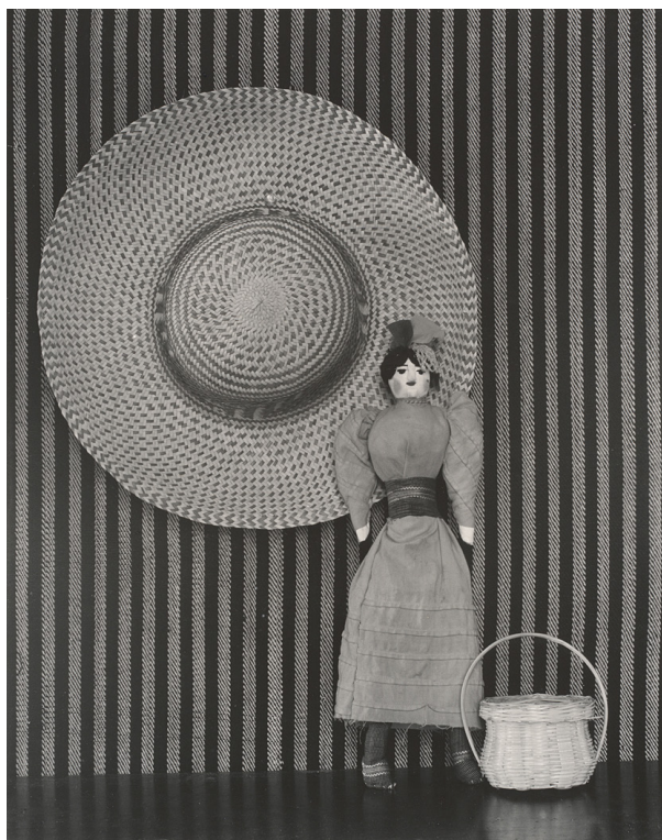
fig. 10 Edward Weston. Juguete, Doll and Sombrero . 1926. Gelatin silver print, 9 7 / 16 × 7 1 / 2 " (24 × 19.1 cm). Collection Center for Creative Photography. © 1981 Center for Creative Photography, Arizona Board of Regents