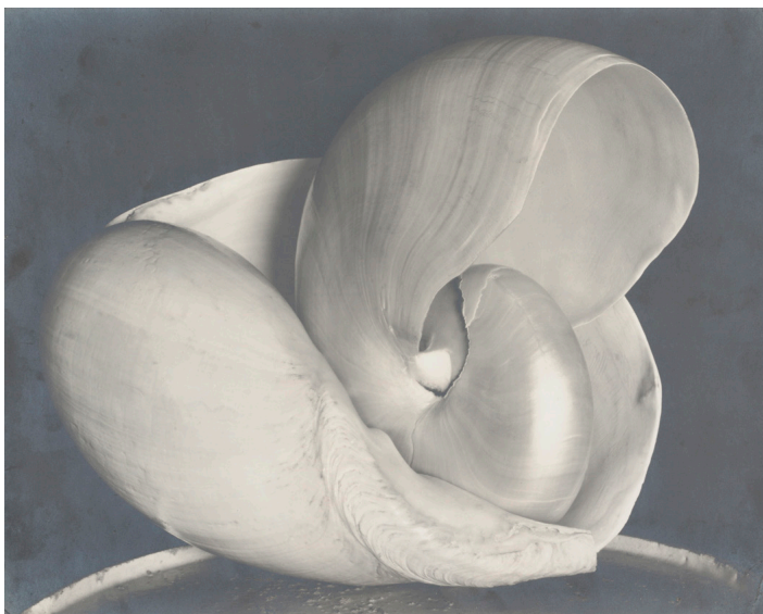
fig. 12 Edward Weston. Shells . 1927. Gelatin silver print, 7 5/8 x 9 1/2" (19.3 x 24.1 cm). Collection Center for Creative Photography. © 1981 Center for Creative Photography, Arizona Board of Regents

steel mills, coal mines, textile mills, or automobile factories—and the König-Albert-Museum was a small, regional institution, known primarily as the repository of a very fine mineralogical collection. But Gurlitt was a man with a finely tuned eye and a clear sense of direction, and very likely his previous association with the Bauhaus architects and designers had convinced him that the Deutscher Werkbund's efforts to showcase photography as a medium worthy of respect was a position he could wholeheartedly endorse.