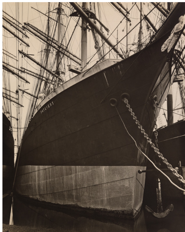
fig. 11 Edward Weston. Boat, San Francisco. 1925. Gelatin silver print, 9 5 / 16 × 7 9 / 16 " (23.7 × 19.2 cm). The Museum of Modern Art, New York. Thomas Walther Collection. Grace M. Mayer Fund (MoMA 1907.2001) Collection Center for Creative Photography.