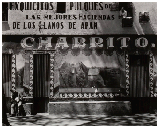
fig. 7 Edward Weston. Pulquería, Mexico. 1926. Gelatin silver print, 1941, 7 ½ × 9 ¾" (19.1 × 23.8 cm). The Museum of Modern Art, New York. Anonymous gift. Collection Center for Creative Photography.