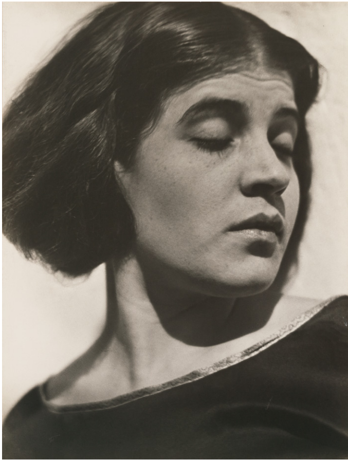
fig. 4 Edward Weston. Tina. January 30, 1924. Gelatin silver print, 1924–42, 9 1/16 × 6 7/8" (23 × 17.5 cm). The Museum of Modern Art, New York. Thomas Walther Collection. Grace M. Mayer Fund and The Fellows of Photography Fund, by exchange (MoMA 1906.2001) Collection Center for Creative Photography.

(Whether Weston responded to the newspaper's request for more photographs is not known, but no other Weston images have yet been located in subsequent issues of the Berliner Tageblatt or its companion magazine.)