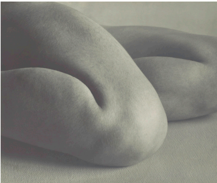
fig. 13 Edward Weston. Nude . 1927. Gelatin silver print, 6 3/4 x 9 1/4" (15.5 x 23.1 cm). The Metropolitan Museum of Art, New York. Gilman Collection, Purchase, Anonymous Gifts. Digital image © The Metropolitan Museum of Art. Image courtesy Art Resource, NY. Collection Center for Creative Photography. © 1981 Center for Creative Photography, Arizona Board of Regents

Although Modotti arrived in Berlin too late to view the abbreviated version of the Film und Foto exhibition, which had ended the previous November, she quickly came to the realization that there was already an abundance of talented photographers working in Germany. Consequently, she expressed doubts about attempting to establish a portrait studio in Berlin, telling Weston, "competition here is so great, and the prices so cheap that I do not feel valiant enough to step in and compete." 47 She did, however, submit examples of her work to the Arbeiter-Illustrierte-Zeitung (AIZ), a weekly anti-Fascist magazine where several of her photographs were reproduced. Photographer Lotte Jacobi also provided assistance by giving Modotti access to her darkroom and studio, but during the summer of 1930 Modotti was sent on a series of clandestine missions (probably at the behest of Alfons Goldschmidt)—dangerous forays that took precedence over her photography efforts. Writer Anita Brenner, who had