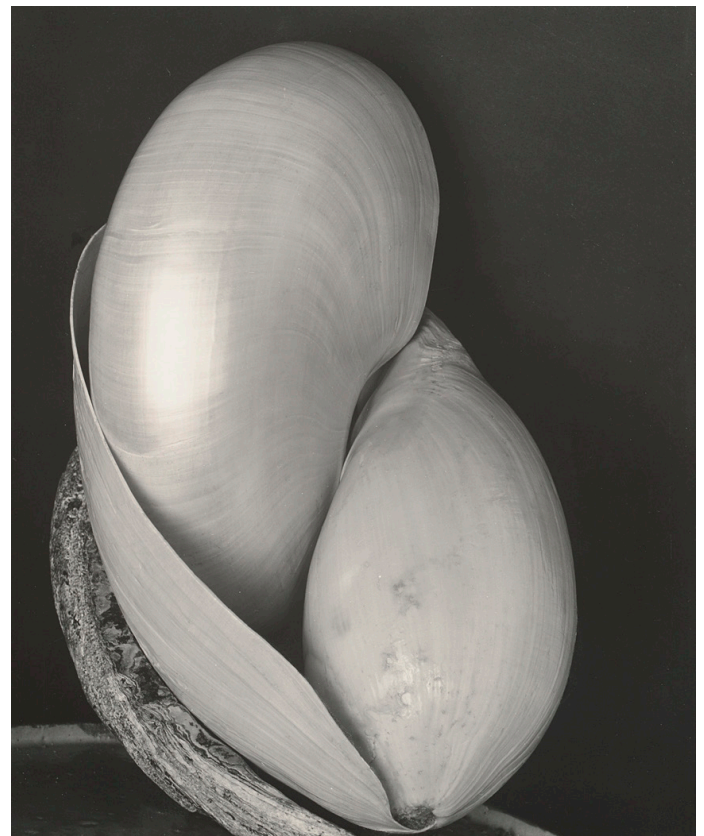
fig. 14 Edward Weston. Shells . 1927. Gelatin silver print, 9 7/8 x 8" (25.1 x 20.3 cm). Collection Center for Creative Photography. © 1981 Center for Creative Photography, Arizona Board of Regents