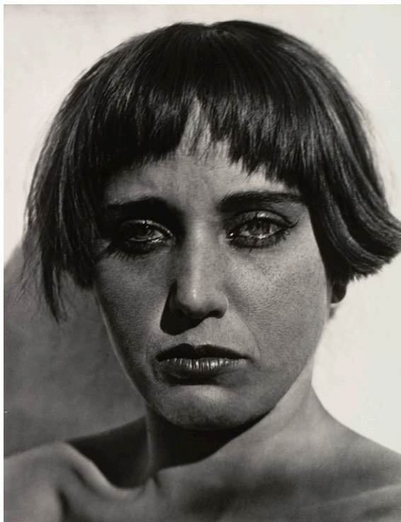
fig. 5 Edward Weston. Nahui Olin . 1923. Gelatin silver print, 9 × 6 15/16 " (22.9 × 17.7 cm). The Museum of Modern Art, New York. Purchase. Collection Center for Creative Photography. © 1981 Center for Creative Photography, Arizona Board of Regents

Just now I receive yours and Brett's prints. Many thank. . . . I also receive today a letter from the Exposition Committee saying that they are writing you happily a personal invitation and give you full liberty for your group. 26