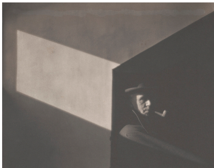
fig. 1 Edward Weston. Sunny Corner in an Attic . 1921. Platinum print, 7 1/2 x 9 7/16" (19 x 24 cm). Johan Hagemeyer Collection/Purchase. Collection Center for Creative Photography. © 1981 Center for Creative Photography, Arizona Board of Regents

By the late 1910s, Weston's circle of friends included several European- and British-born actors and designers who shared a deep admiration for, and in some cases a personal relationship with, the venerable impresario Max Reinhardt. Since 1905 Reinhardt had presided over Berlin's highly influential Deutsches Theatre , where he had become the most important theatrical exponent of the German Expressionist