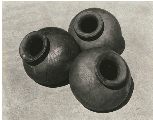
fig. 8 Edward Weston. Tres Ollas de Oaxaca . 1926. Gelatin silver print, 7 ½ × 9 7/16" (19.1 × 23.9 cm). Collection Center for Creative Photography. © 1981 Center for Creative Photography, Arizona Board of Regents