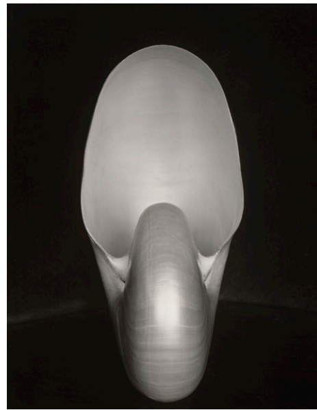
fig. 3 Edward Weston. Shell . 1927. Gelatin silver print, 9 3 / 8 × 7 5 / 16 " (23.8 × 18.6 cm). The Museum of Modern Art, New York. Gift of Merle Armitage. Collection Center for Creative Photography.

Because Weston's extended stay in Mexico was intriguing to Angelenos who wanted to know more about