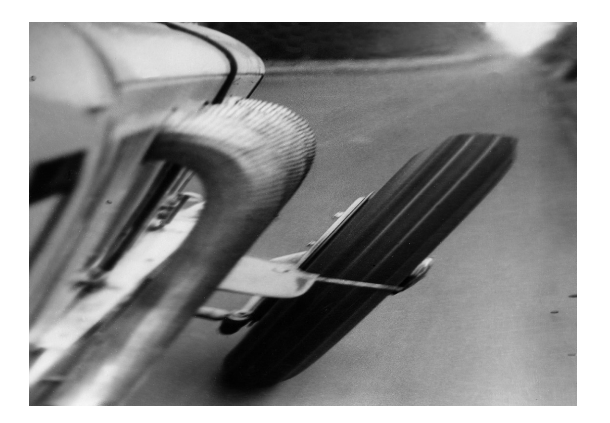
fig. 8 Willi Ruge. From the series On the Avus with Caracciola (Mit Caracciola über die Avus) . 1931. Ullstein Bild/The Granger Collection, New York. © The Granger Collection I td.

Ruge adopted an even more radical position in his parachuting reportage, which appeared in 1931—first in Berlin, in May, and then in London a month later. We can assume that the coverage included around twenty photographs, fourteen of which are in the Walther Collection. Sixteen pictures in this series are known to be extant; five of the published images have not been located to date. The quality of the prints is that of most press photos of the time, which were either produced by the photographers themselves in multiples, directly from the negative, and then sent to various newspapers and magazines, or reproduced and enlarged by partner agencies for further circulation.<sup>24</sup> Ruge's parachuting reportage was his greatest success. It was published as a three-page article in the Berliner Illustrirte Zeitung, then printed the same year in the Illustrated London News and in three American magazines—and the photos were still being sold and printed as a sensational reportage in the mid-1930s.<sup>25</sup> Thanks to the accompanying text (written by Ruge for the Berlin magazine) and the captions on the backs of the photographs, it is possible to reconstruct the shooting sequence. In his text, Ruge also refers to the difficulties he faced in getting permission for his adventure, first in being allowed to take the required training course: "The director of the parachute factory was interested in our plan, but also somewhat