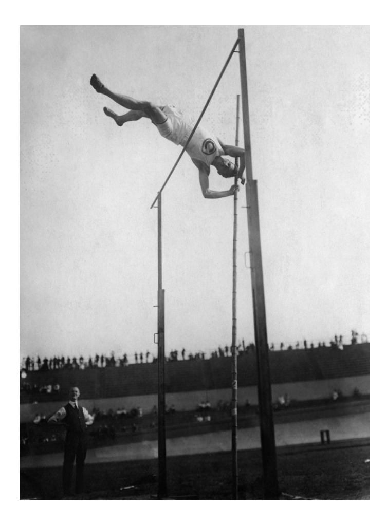
fig. 2 Willi Ruge. The high-jumper Alfred Lehninger in Berlin. 1924. Ullstein Bild/ The Granger Collection. New York. © The Granger Collection Ltd.

and illustration agencies or distributors. A number of brochures and other publications, widely available in Berlin, dispensed practical hints as well as cautionary advice to those flocking to the burgeoning profession early in the century. In a 1913 handbook for aspiring press photographers, Paul Dobert, editor-in-chief of Die Woche , wrote, "Thousands of professional photographers and tens of thousands of amateur photographers worldwide are eager to be part of the illustrated press. They are tempted by money and fame, and it seems easy to become a contributor; all you have to do is 'take a shot,' develop it, copy it, and then send off the finished photo. Usually, however, the photo will be returned to the newcomer, and he will quickly notice that it is not so easy to deliver perfect photographs to the press."