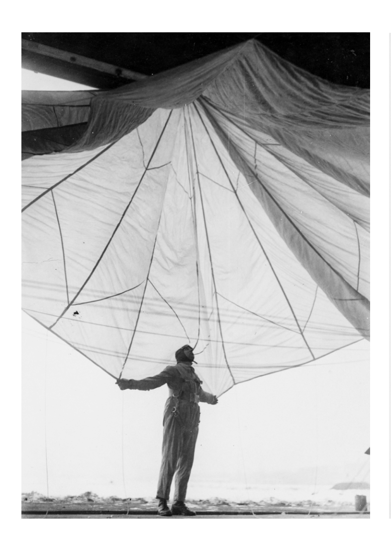
fig. 9 Willi Ruge. From the series... It Opened After All (\dots und er entfaltet sich doch ). c. 1930.

Ruge's adventurous approach to photography also took him behind the scenes of a gynecology clinic. His comprehensive and very detailed work on a hospital delivery room was a cover story for the Berliner Illustrirte Zeitung in 1931.<sup>30</sup> Reportages in Argentina and in Egypt and other African countries ensued during the 1930s, but he still continued to follow local events.