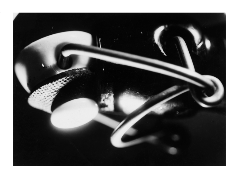
fig. 3 Willi Ruge. From the series Fantasy of Small Things (Phantastik der kleinen Dinge). Late 1920s. © Keystone/IBA-Archiv/Willi Ruge

Fotoaktuell delivered material that was less topical than other press photography agencies. In some series Ruge tried to find an equivalent to the radical realism and formal experimentation of the Neues Sehen (New Vision) movement, as exemplified in Fantasy of Small Things ( Phantastik der kleinen Dinge ) and its photos of everyday items (fig. 3). In 1927, six of these pictures were printed in the magazine Die Woche under the title The Fickleness of the