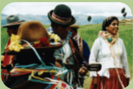
LOVING EACH OTHER IN THE SHADOWS

In the first fiction by an indigenous Andean woman, a divided village sets the stage for a star-crossed love affair. In Quechua, English subtitles.