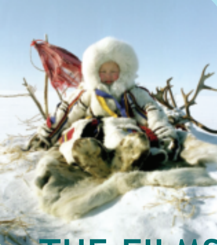
A BRIDE OF THE SEVENTH HEAVEN