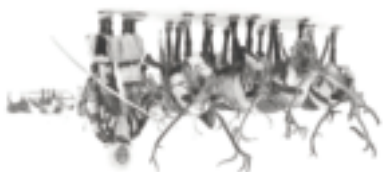
A BRACE OF THE SEVENTH HEAVEN

Film and Video Center Smithsonian Institution National Museum of the American Indian One Bowling Green New York, NY 10004-1415