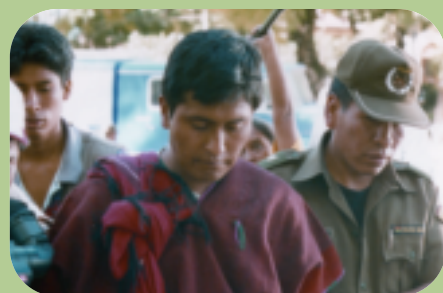
ANGELS OF THE EARTH

Lowe's edgy first feature traces a budding romance between two young adults whose tribal culture shapes their bond in powerful and unexpected ways.