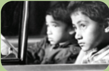
TWO CARS ONE NIGHT

In this thriller Maori join forces with German friends to recover from a Berlin museum the ancestral carvings stolen from their homeland a century ago. In Maori, English subtitles.