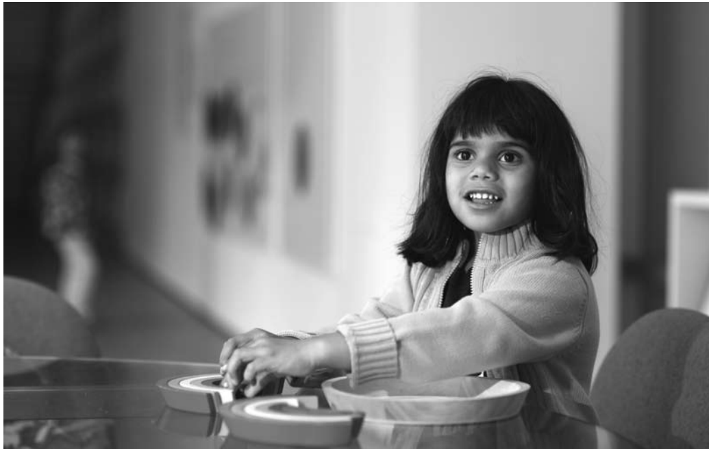
Left

These lessons focus on how artists are inspired by their everyday surroundings. Works can relate to depictions of everyday scenes or to an artist's personal history and can include a variety of mediums.