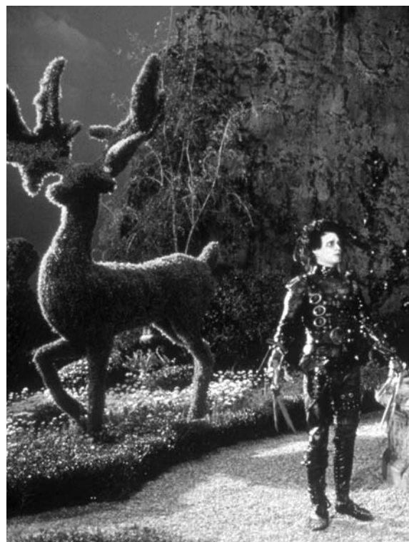
Left: Edward Scissorhands . 1990. USA. Directed by Tim Burton. Right: Tim Burton (American, born 1958). Still from Tim Burton MoMA Spot . Digital video (color, sound), 30 sec. The Museum of Modern Art, New York