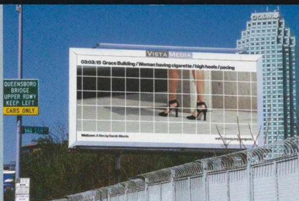
Sarah Morris. Midtown (Grace Building Billboard) . 2002. Digitally printed billboard, 9' 7" x 21' 7" (292.1 x 657.9 cm). Printer: MetroMedia Technologies, New York. Skillman Avenue at Van Dam Street, Long Island City