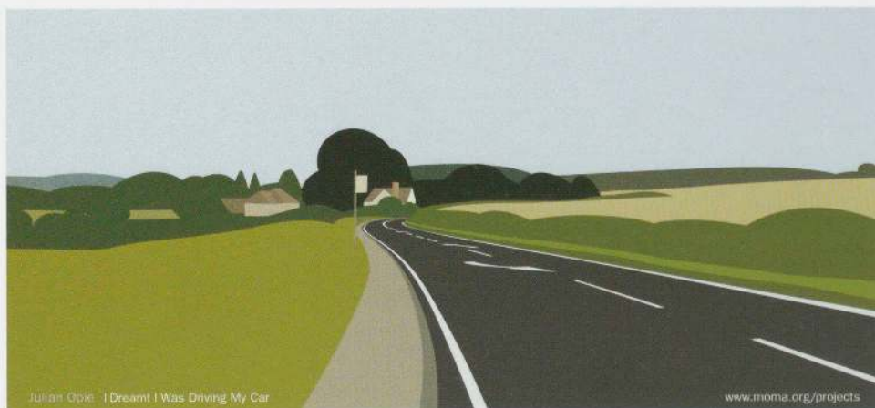
Julian Opie I Dreamt I Was Driving My Car

(see reverse for street addresses and Chelsea locations)