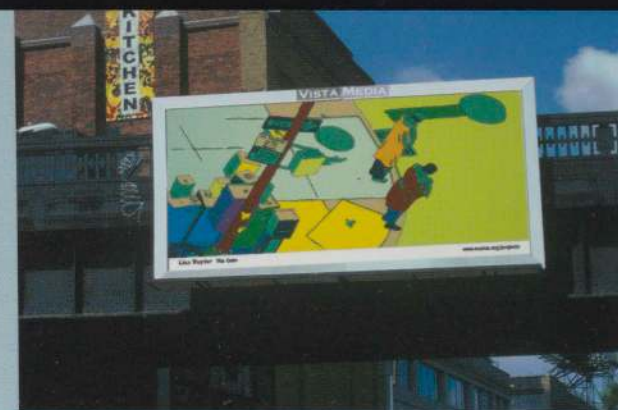
Lisa Ruyter. The Gate . 2002. Digitally printed billboard, 9' 7" x 21' 7" (292.1 x 657.9 cm). Printer: MetroMedia Technologies, New York. 19 Street at Tenth Avenue, Chelsea