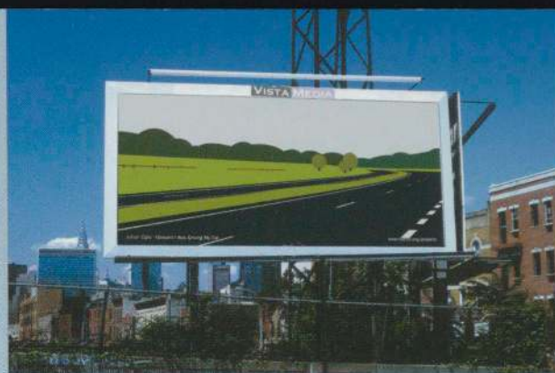
Julian Opie. I Dreamt I Was Driving My Car . 2002. Digitally printed billboard, 9' 7" x 21' 7" (292.1 x 657.9 cm). Printer: MetroMedia Technologies, New York. 11 Street at 48 Road, Long Island City